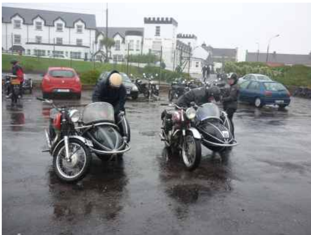
Arriving wet at the Butler Arms Hotel in Waterville for Thursday's lunch.