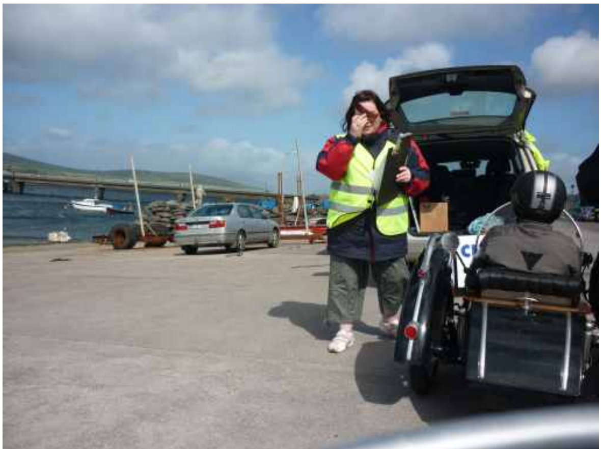
Another timed checkpoint.