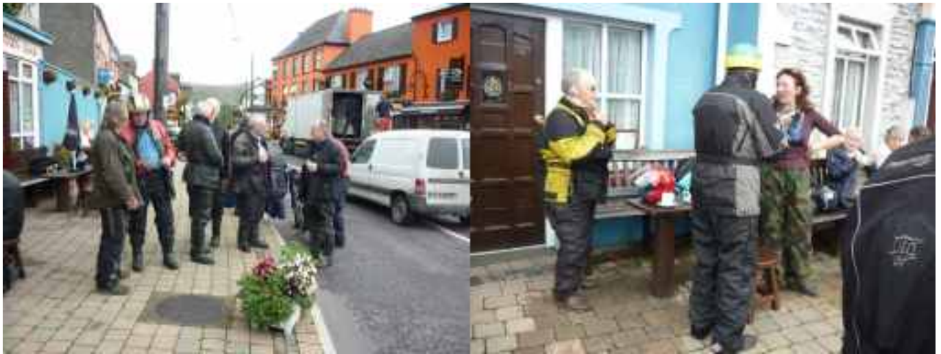
A morning pub stop for much needed refreshments.