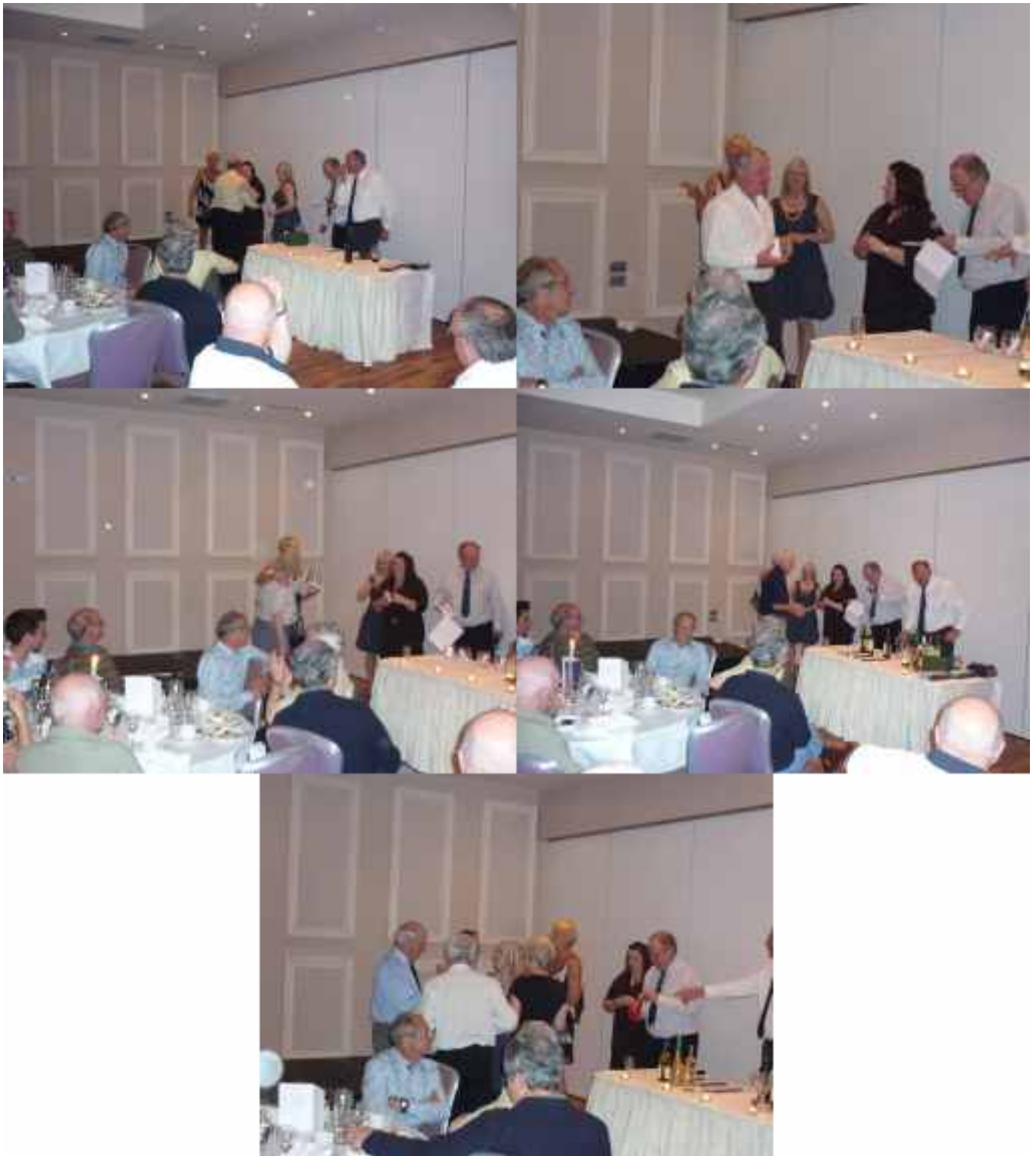
Friday night saw the final dinner together with prize giving. Some very fine Cork Crystal was awarded to the prize winners.