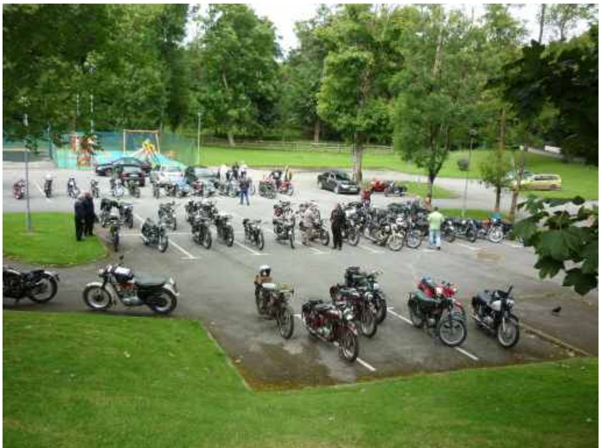
Some of the entrants' machines in the Castlerosse Hotel car park.