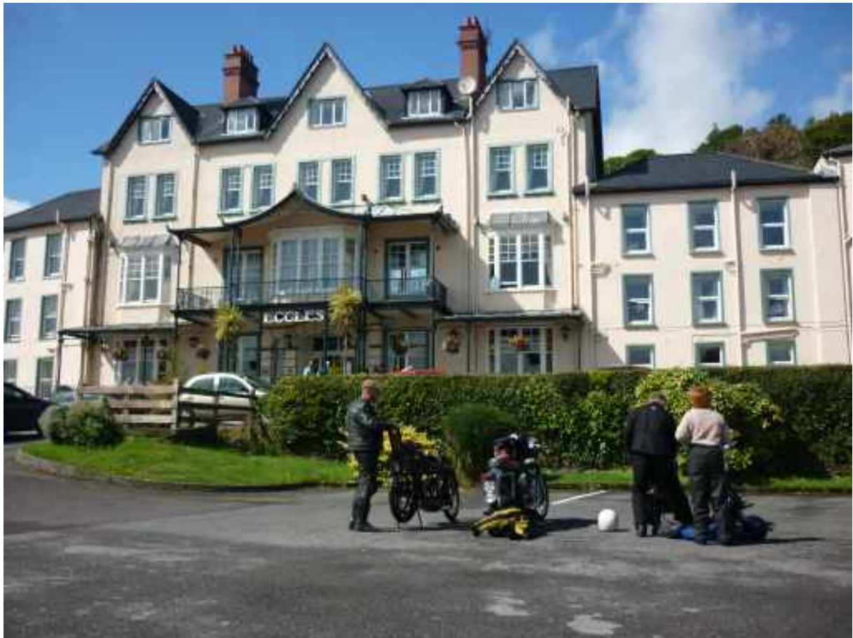
Friday lunch stop was the Eccles Hotel in Glengarriffe