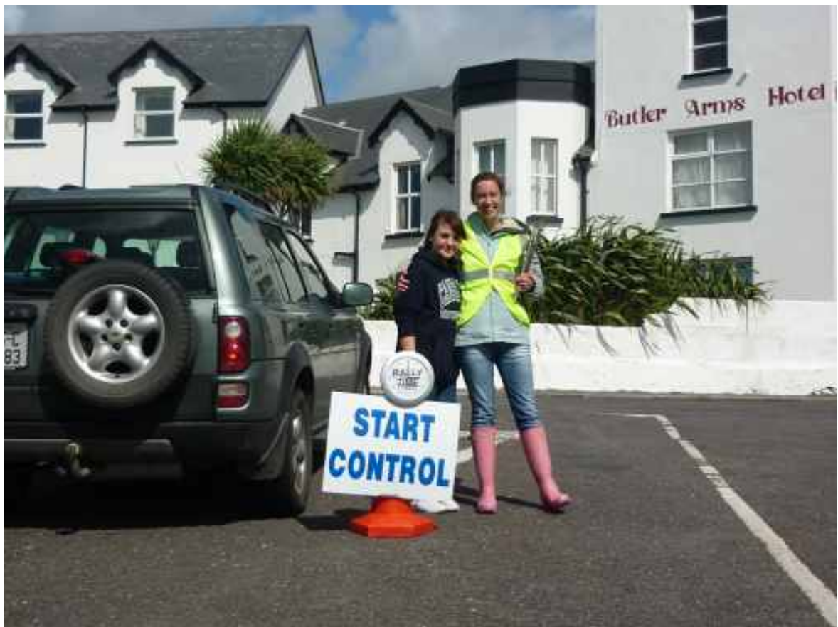
The attractive young lady was back on start control again, this time sporting pink wellies & with an equally pretty assistant.