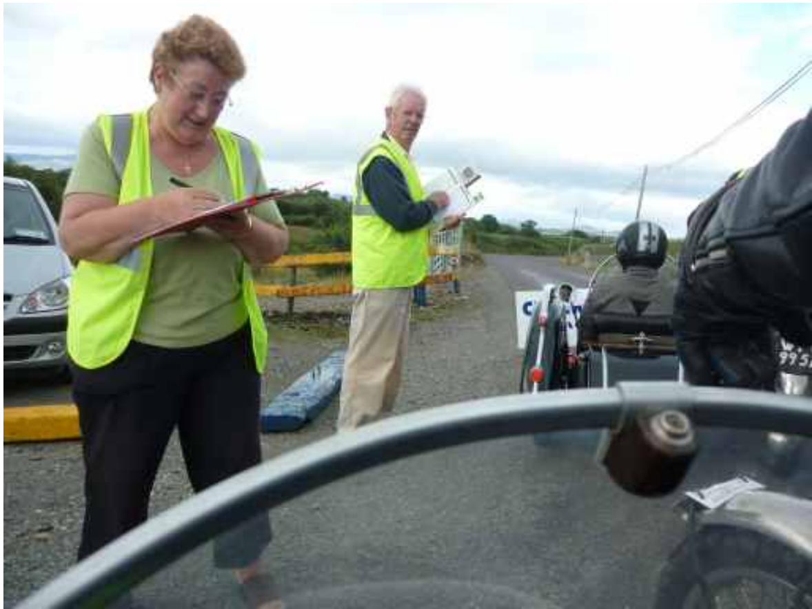
Afternoon timed checkpoint stop.