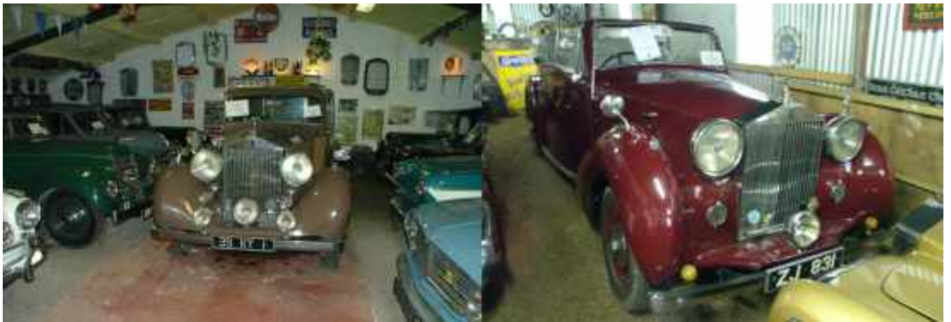
Among the exhibits were these two rather lovely Rolls Royce cars on display in John's museum.