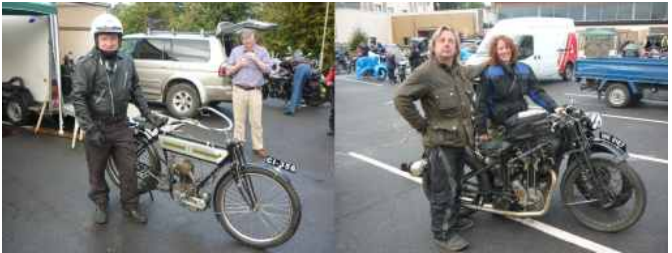
People getting ready for the off on Friday morning.