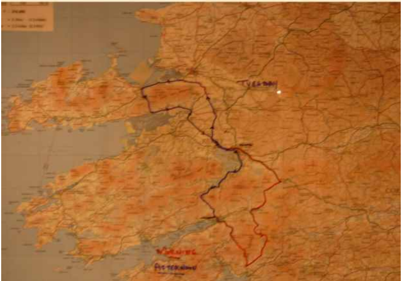
The first day's riding. Tuesday's rally route card & map.