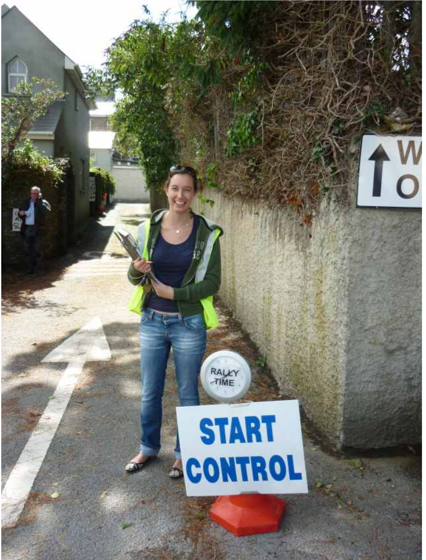
Those riders who were doing the timed checkpoints, were started off after lunch from the West Cork Hotel by this very attractive young lady.