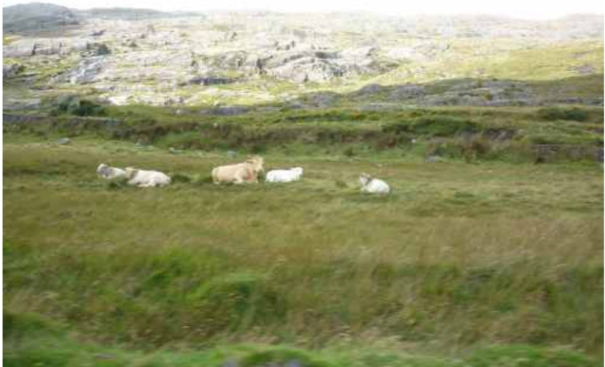
Some of the local residents totally disinterested as the riders passed by.