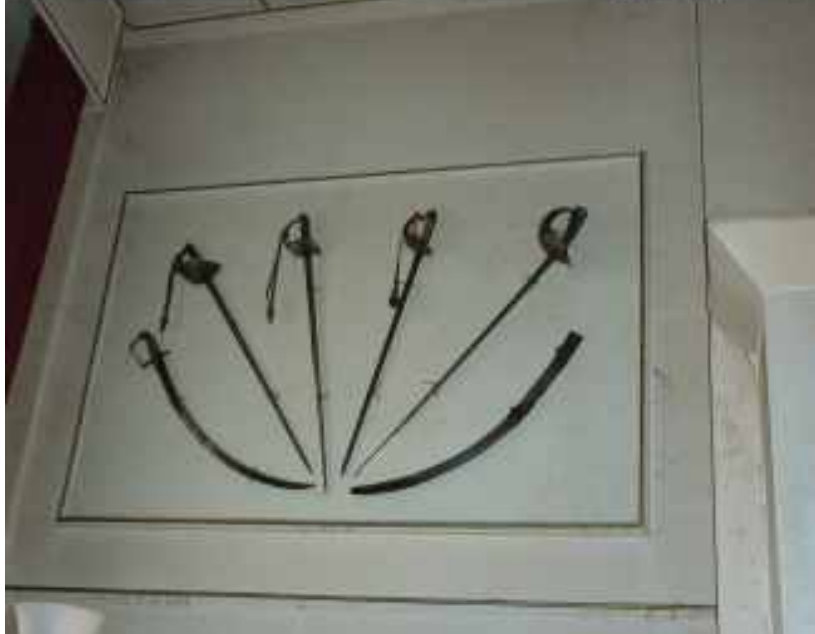
Some great views of the armoury room in the house.