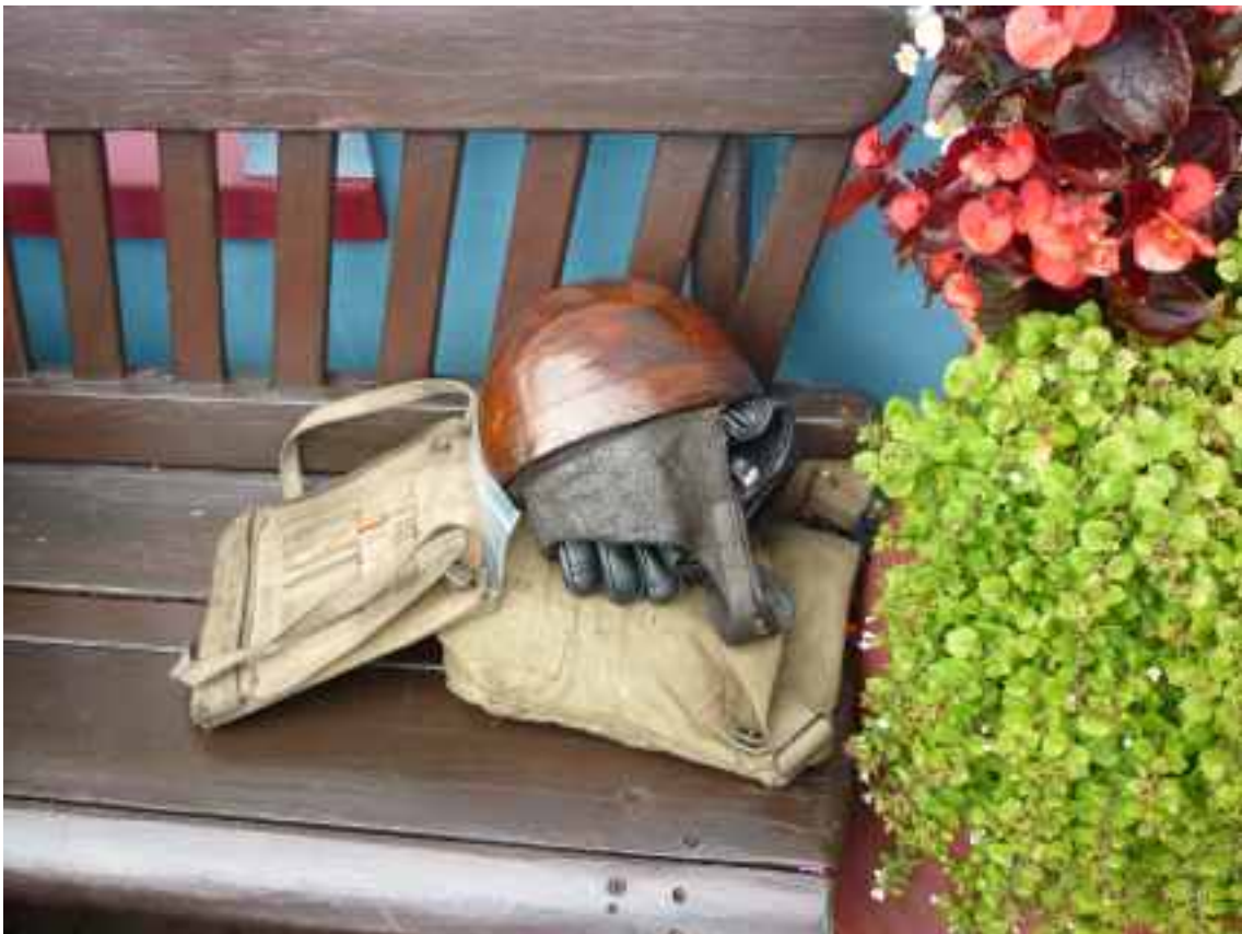
How is this for period riding gear .