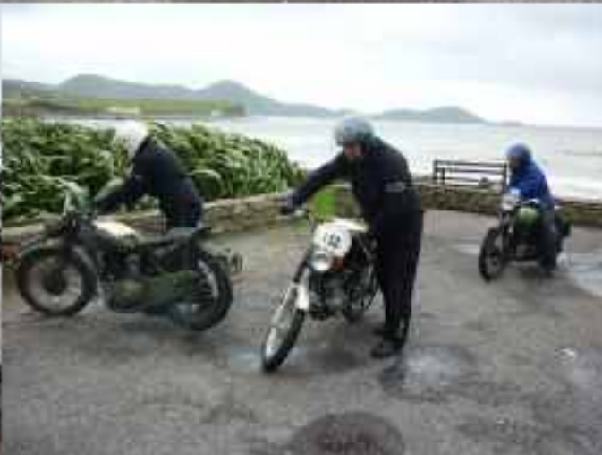
Following a hearty lunch, everyone gets ready to depart for the afternoon route, with a few last minute checks & wet weather gear on.