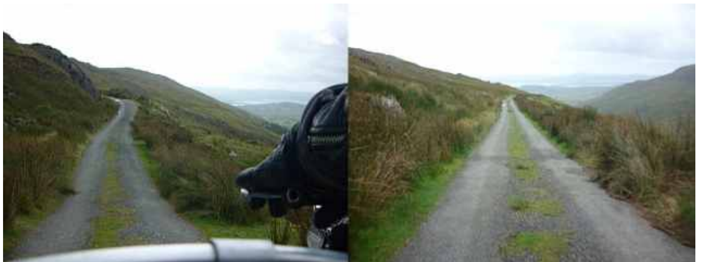
Tuesday morning's route went over Priest's leap & an introduction to the type of roads that would be ridden over the next few days.