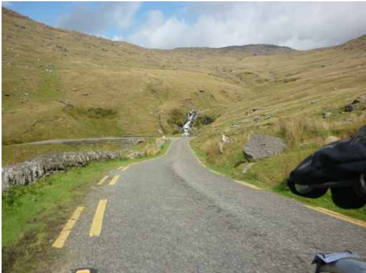
And back down the other side.