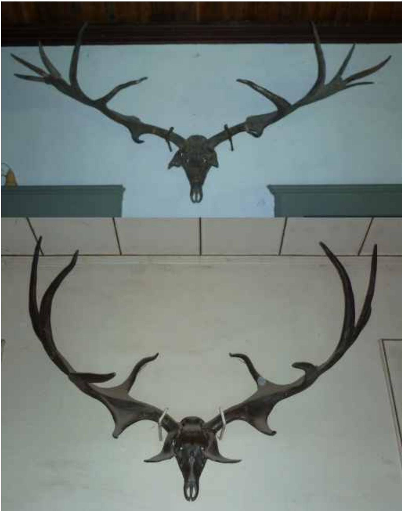
These magnificent specimens decorating some of the walls are prehistoric Elk skulls with antlers recovered from bogs in Ireland, & they were huge – maybe 6 to 7 feet across.