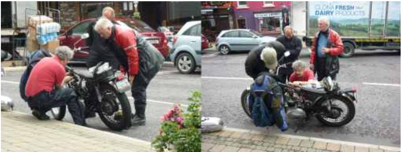
A BSA C15 undergoing running repairs by the roadside.