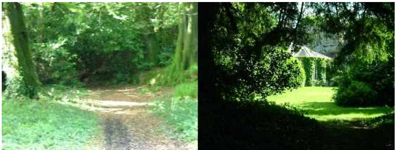
And here are a couple more garden views.