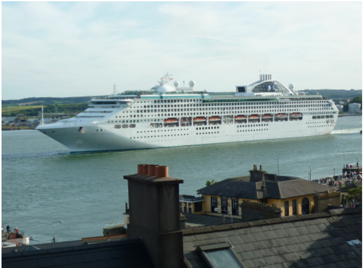
The Dawn Princess leaving Cobh, lets hope all the passengers are back on board.