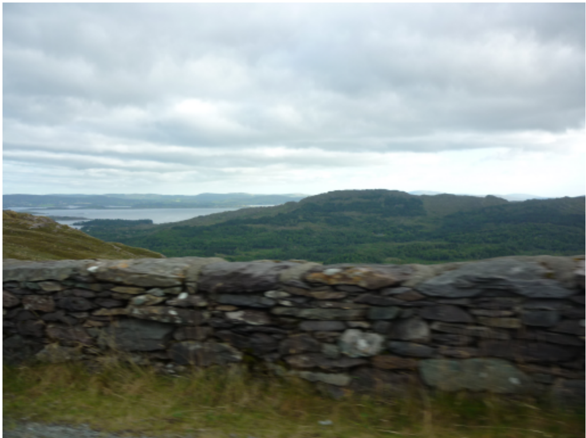
Just one of the many fine views seen during the rally.