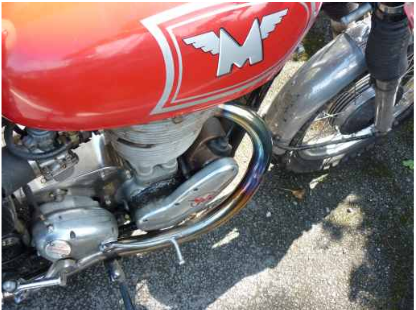
There may be trouble ahead.....