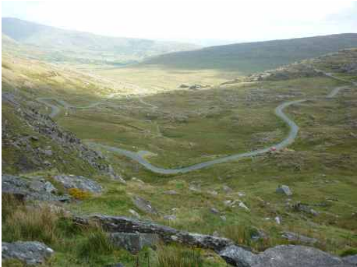
Looking down from Healy Pass at the long & winding road that everyone had just ridden up.