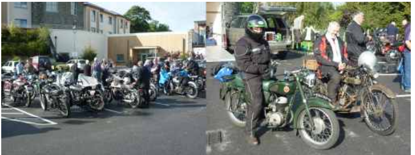
Part of the hotel car park as more motor cyclists arrive. Two rallyists, on a post war Francis Barnett & a flat tank Douglas, giving just a hint of the diversity of machines that were there.