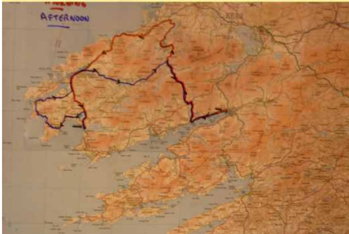
Thursday's rally route card & map.