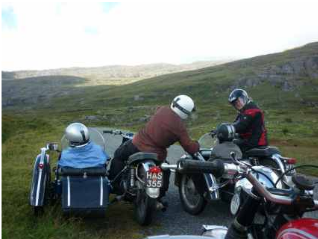
A short stop at the bottom before the climb up to Healy Pass.