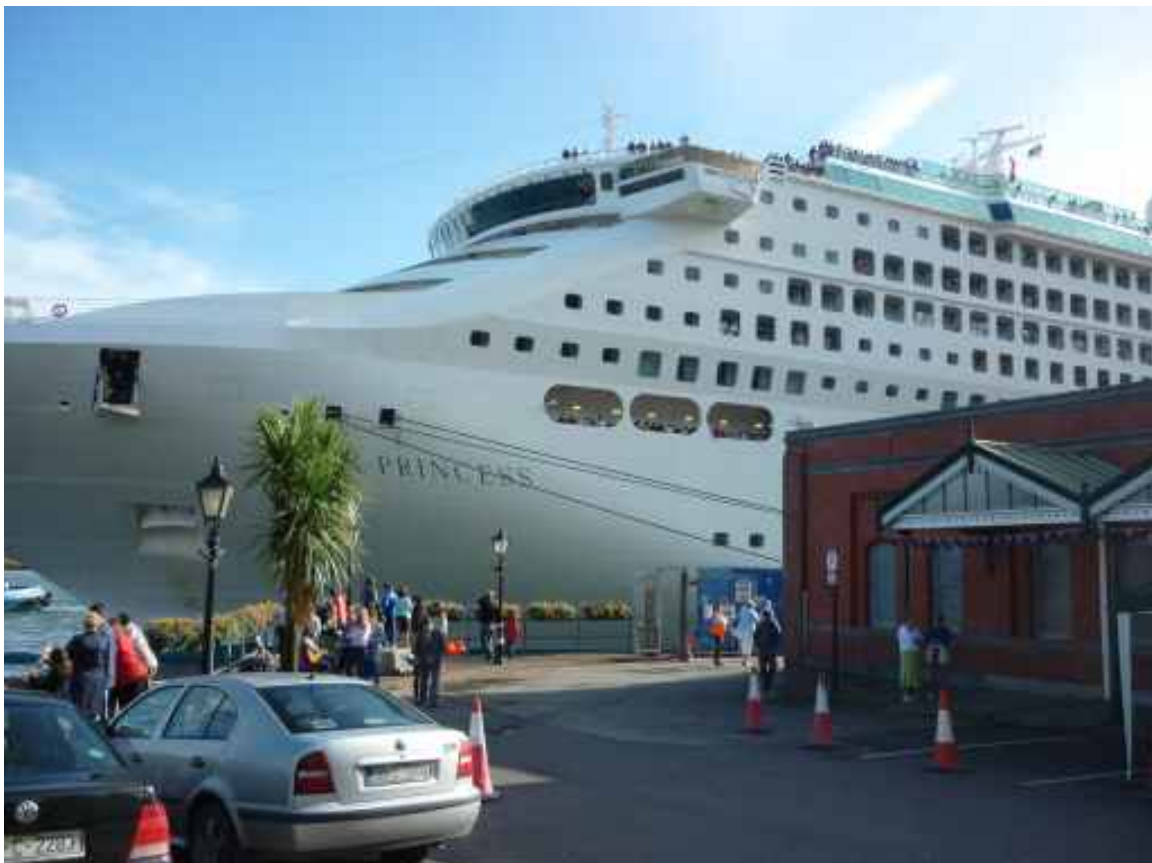
The cruise ship in port, the Dawn Princess of Hamilton.