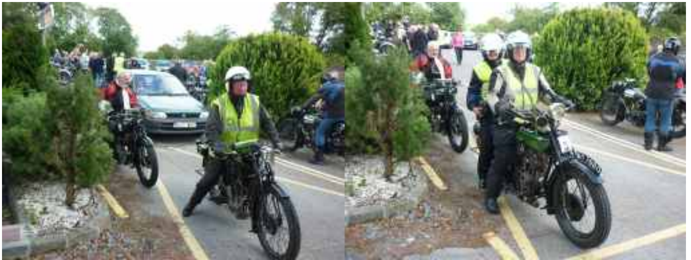
On their way again after lunch, leaving the West Cork Hotel.