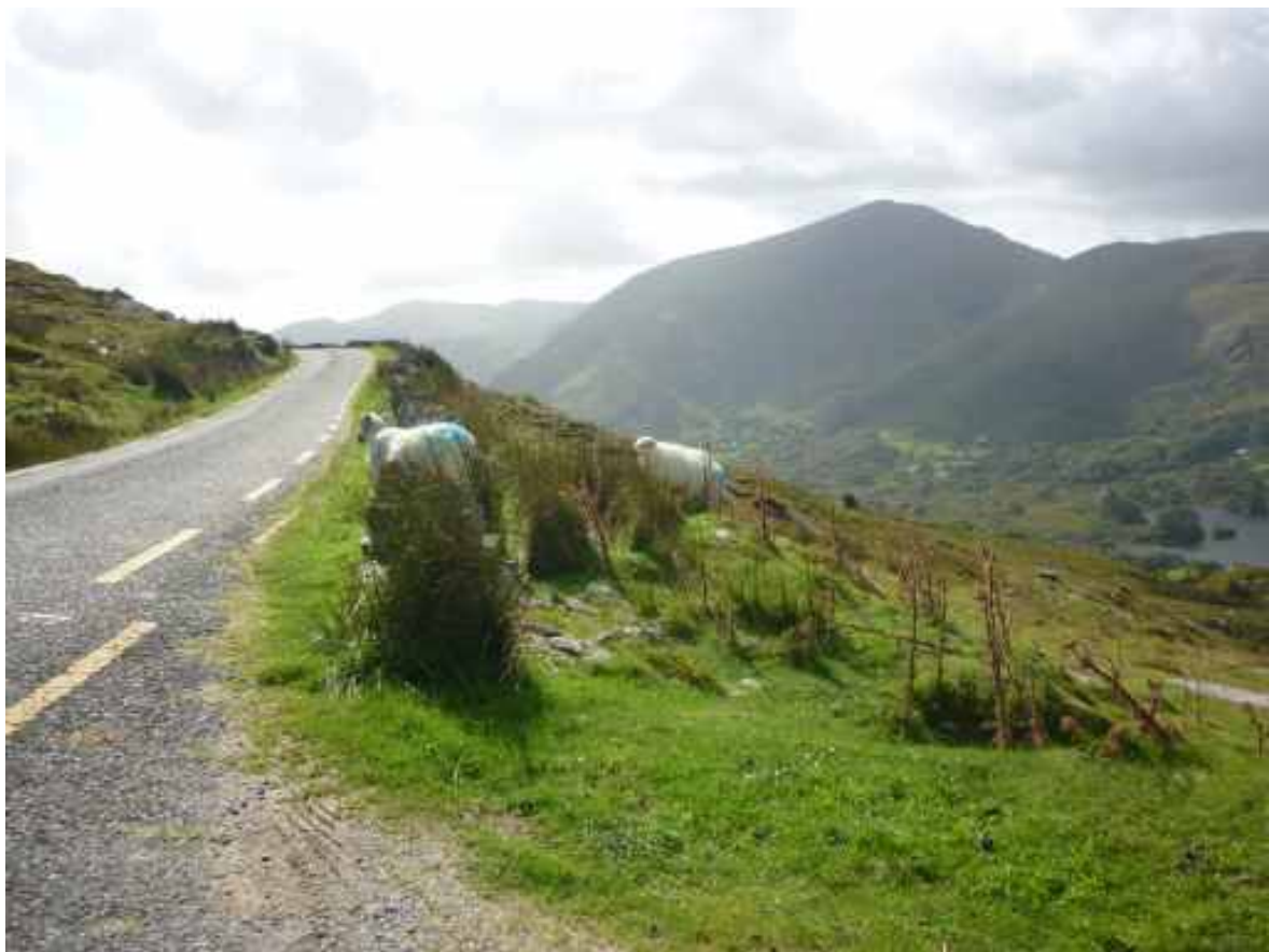
Avoiding woolly obstacles along the way.