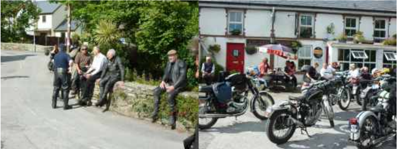
Just lounging around in the sunshine.