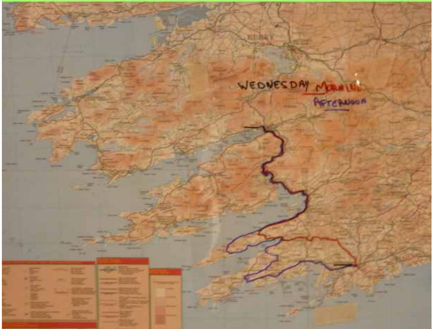
Wednesday's rally route card & map.