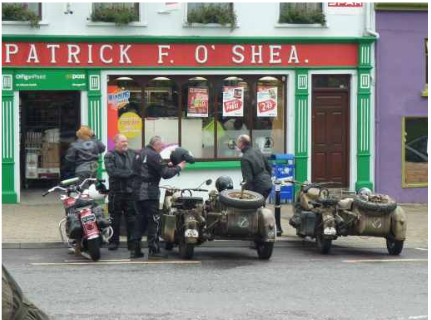
A pair of German WWII machines sit next to an Indian.