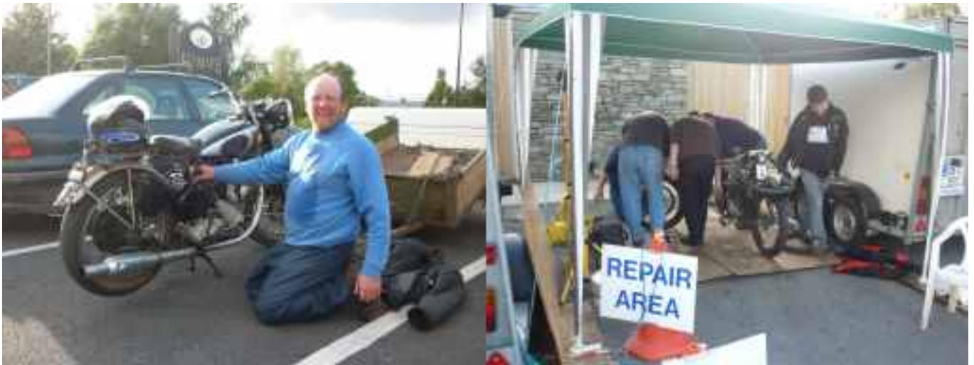
Back at the Kenmare Bay Hotel on Thursday evening, people are already carrying out maintenance & repairs ready for Friday.