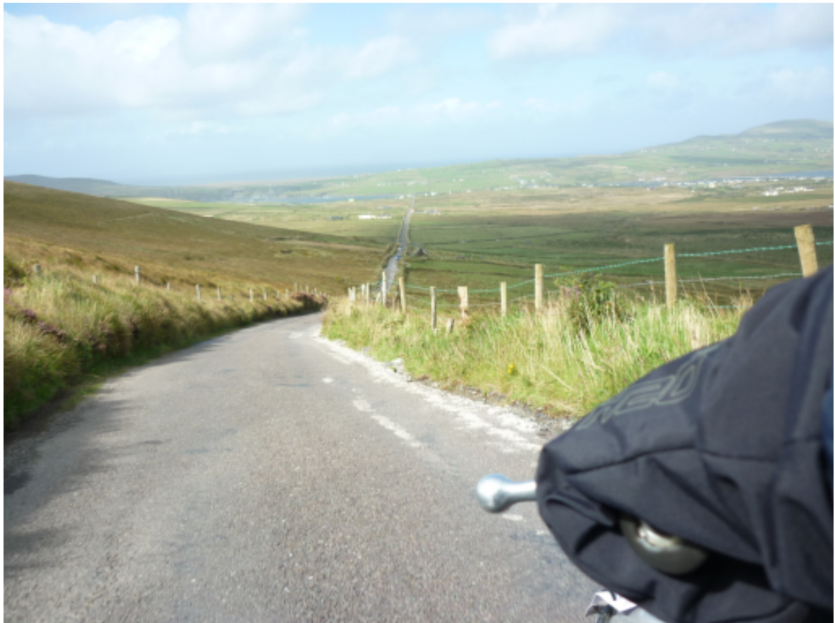
The long road ahead.....