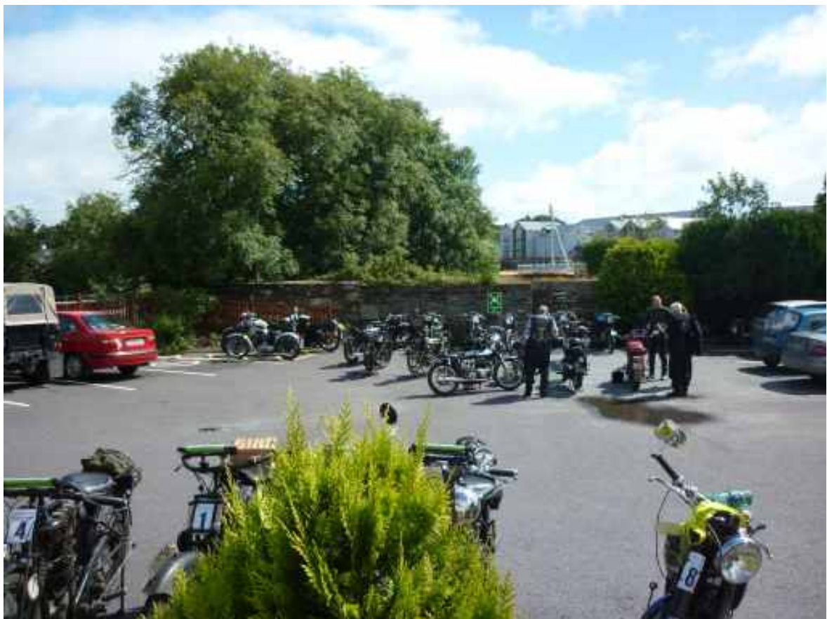
The West Cork Hotel car park filling up.