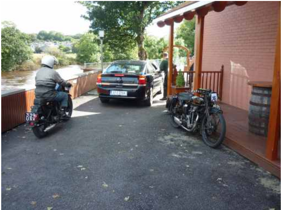
A rider arriving at the West Cork Hotel in Skibbereen for Wednesday's lunch stop.