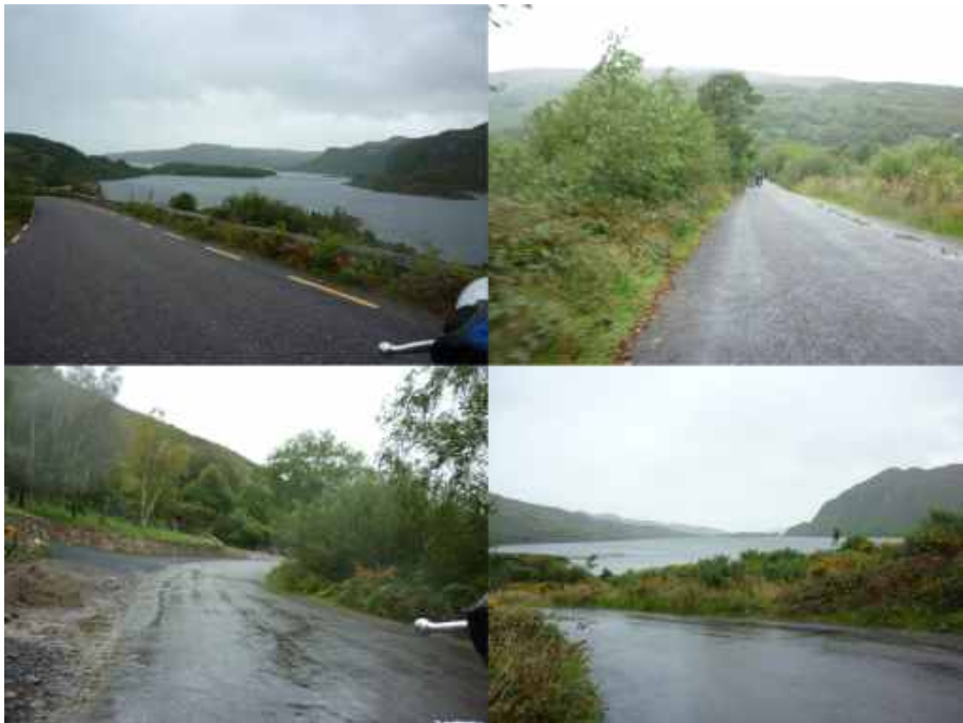
Some more of the great views experienced whilst riding.