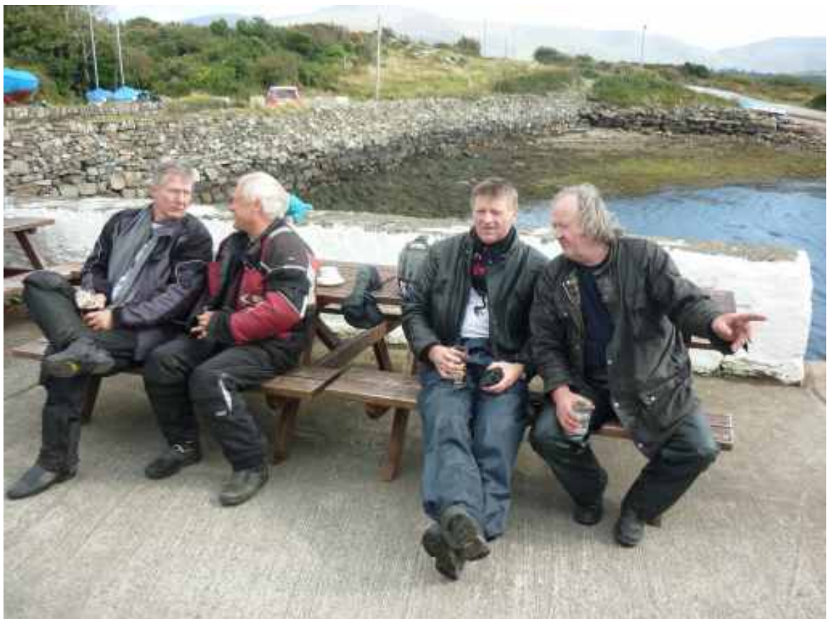
The chance to have a rest & a natter over a drink.