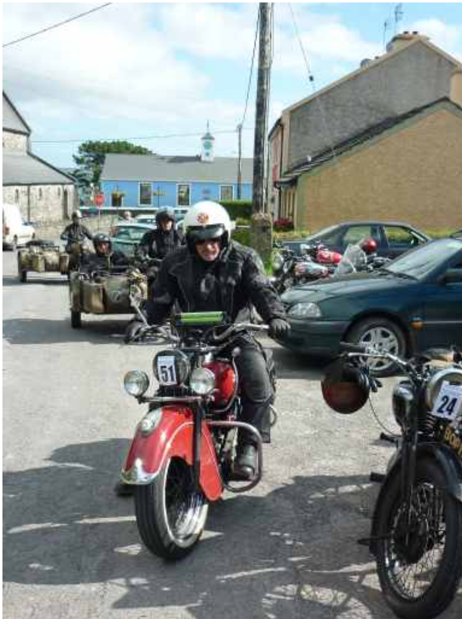
More people needing refreshment.