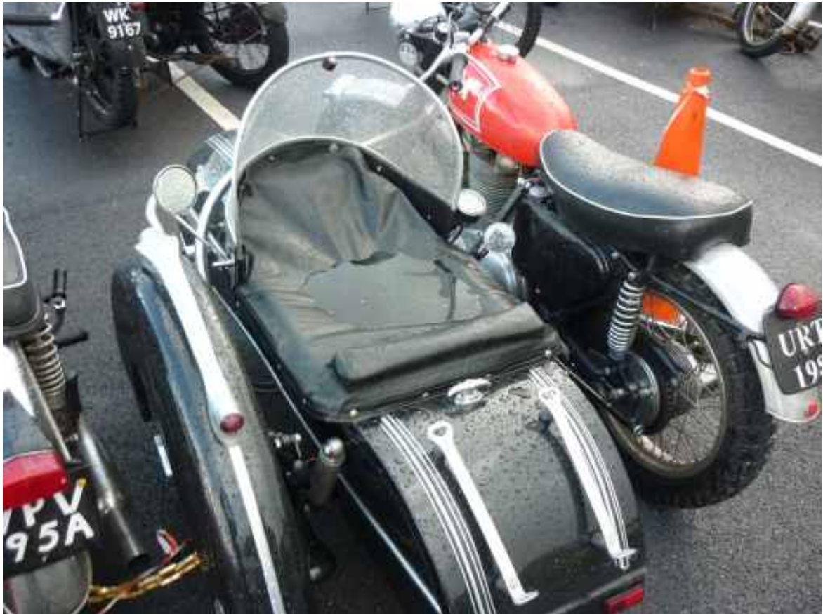
Friday morning & the water feature is back.