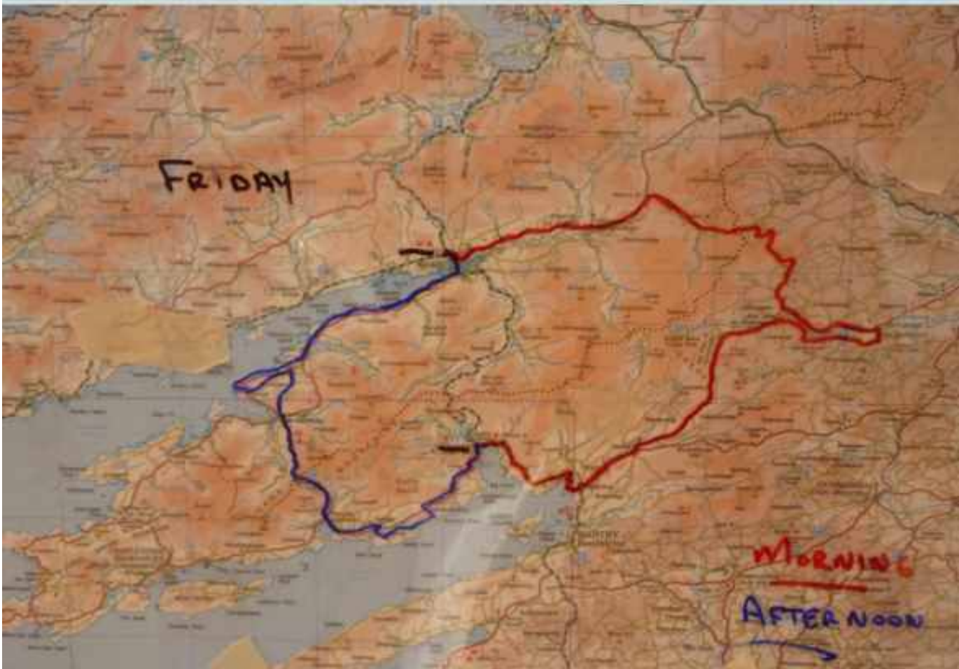
Friday's rally route card & map.