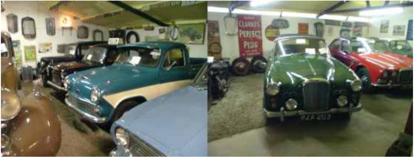
A few more of the motor museum exhibits.