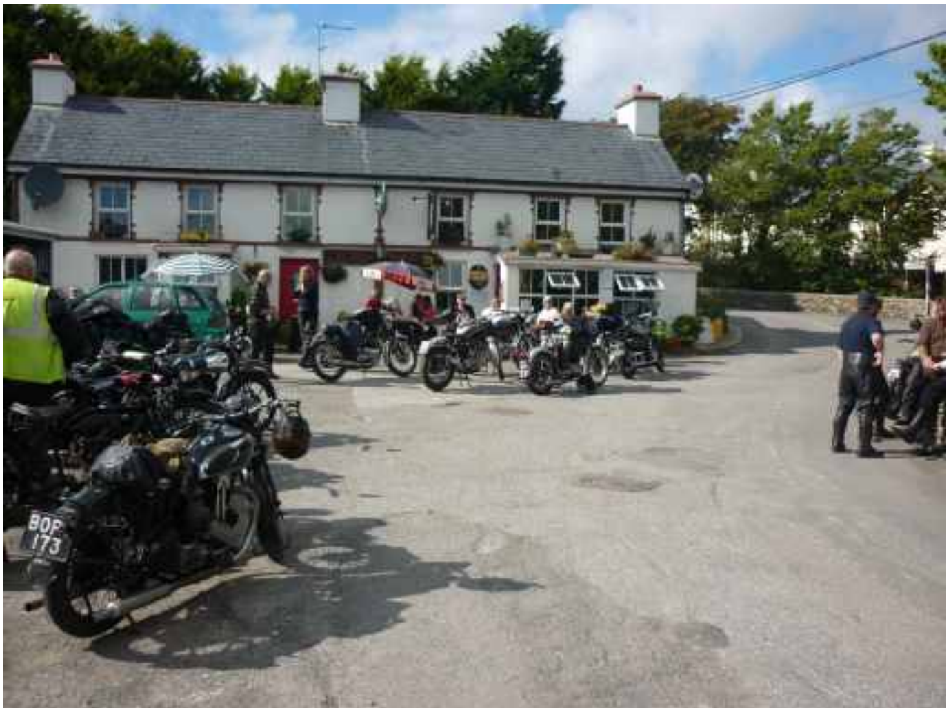
What's this, another pub stop so soon. Well this is half the fun, & such glorious weather too.