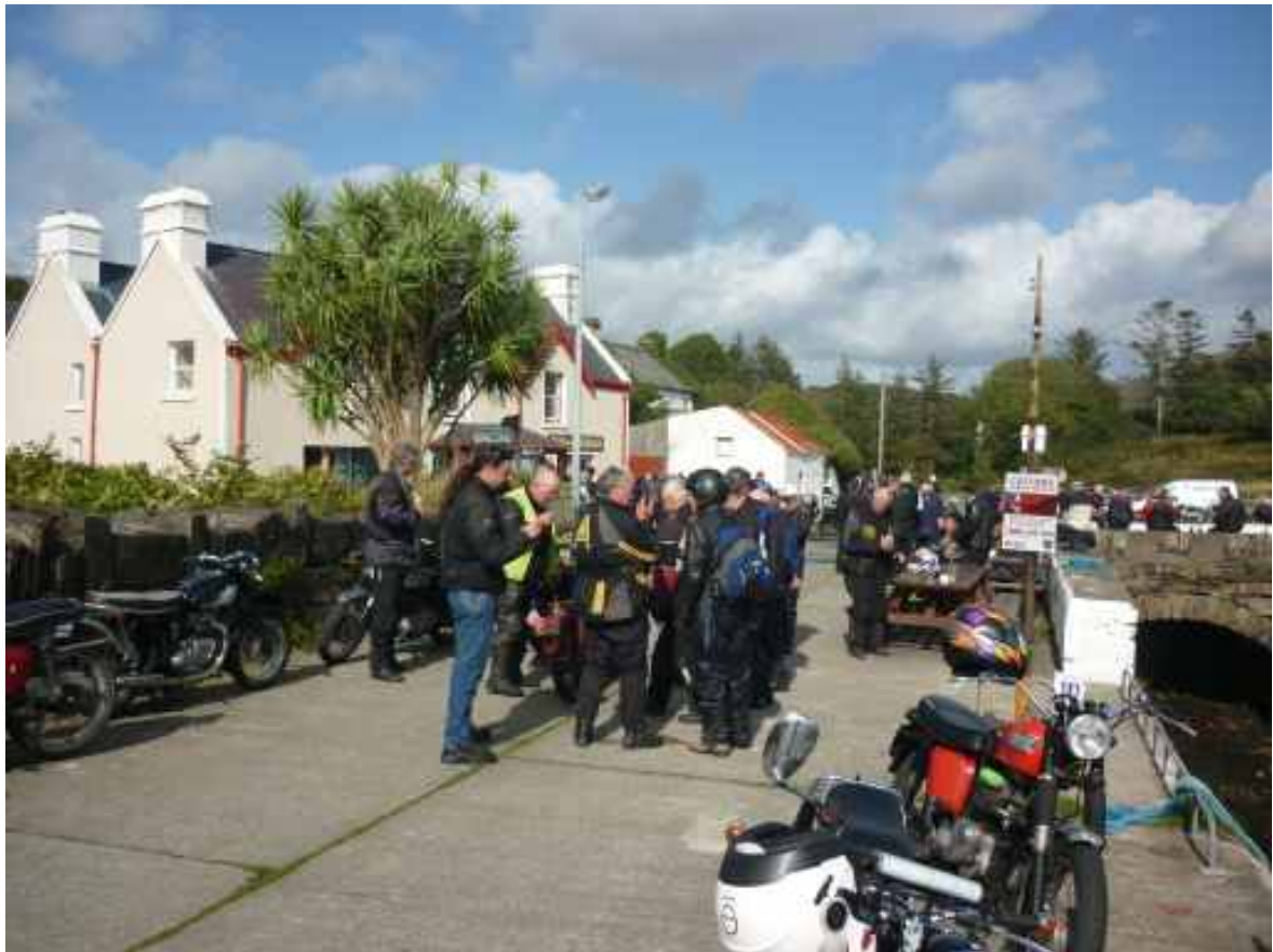
Yes, another pub stop.