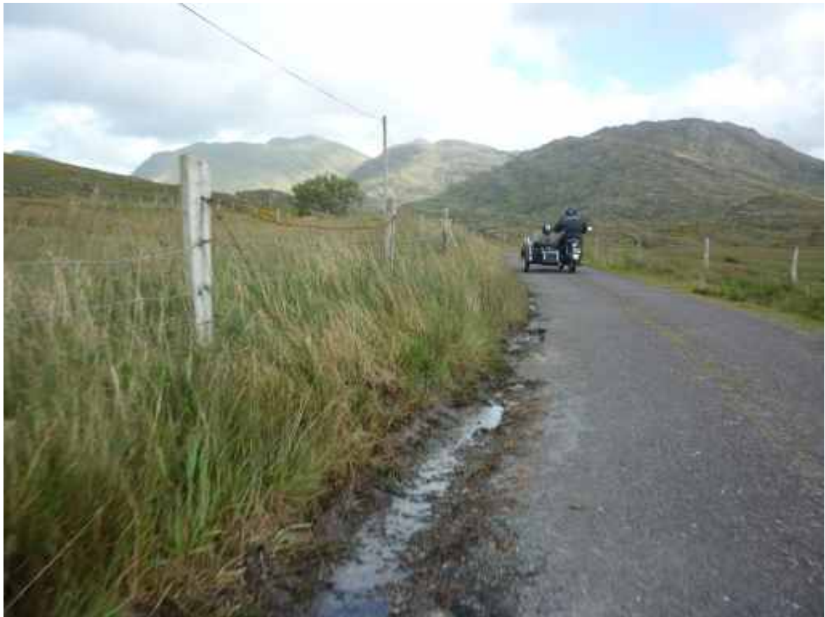
Following Dave & Sylvia.