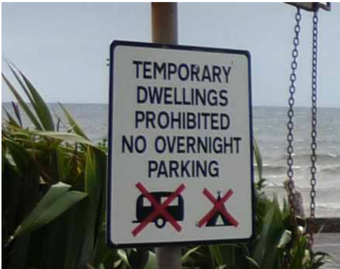
This sign was seen near the hotel. Caravan & wigwams beware!