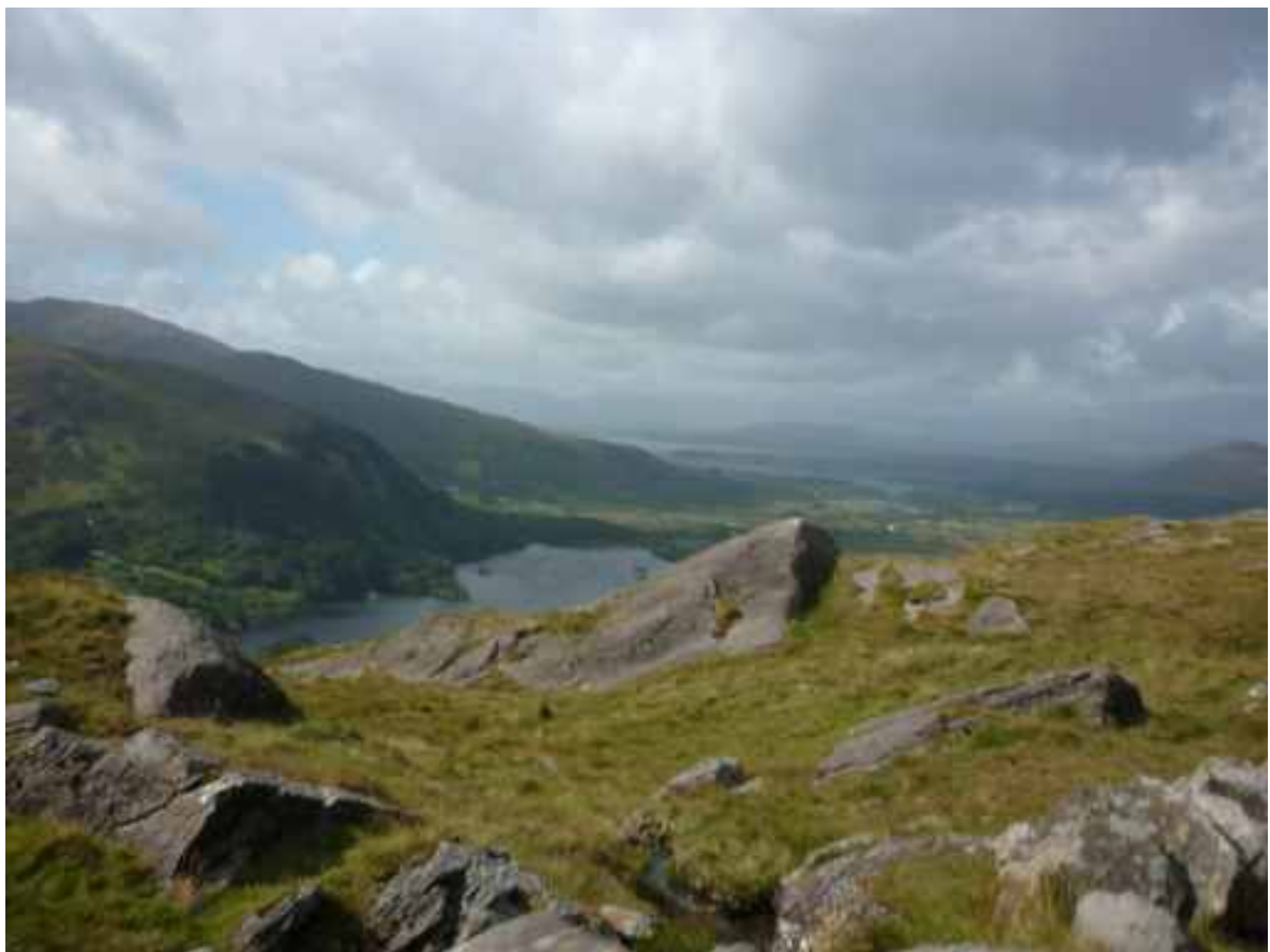
Another amazing view.