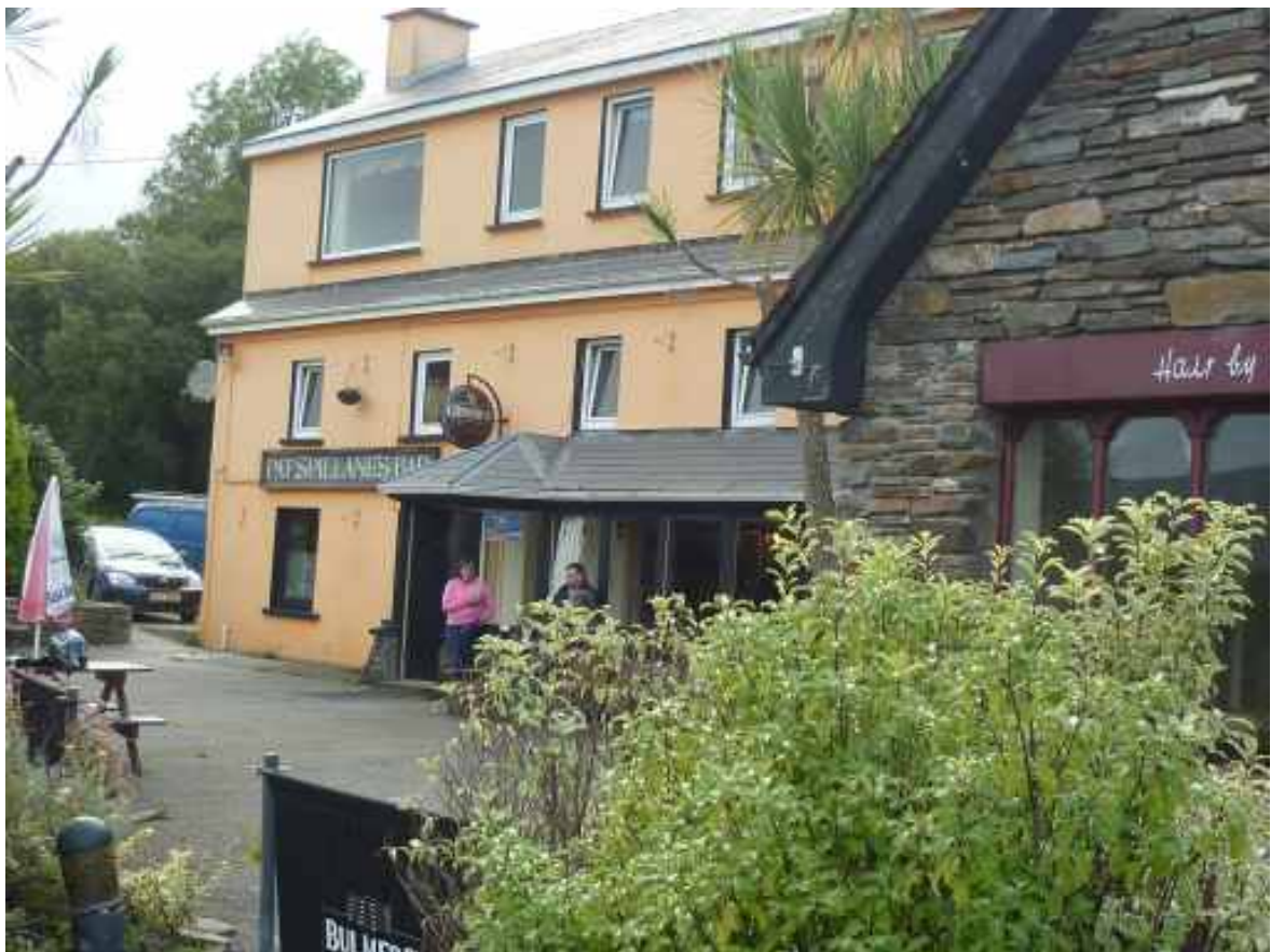
Refreshment time - another pub stop.