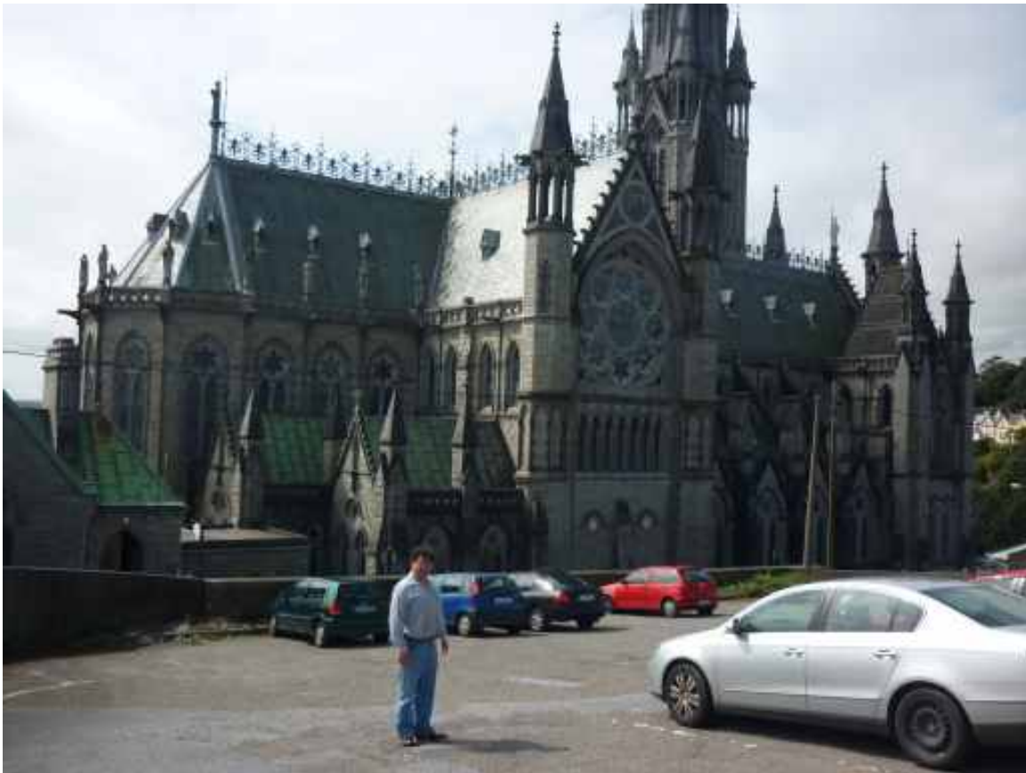
Another day out, a visit to Cobh (pronounced Cove), formally Queenstown.. Now why are those bells paying 'Waltzing Matilda' to organ accompaniment. Are it's Australia day in honour of a visiting cruise liner from the Antipodes.