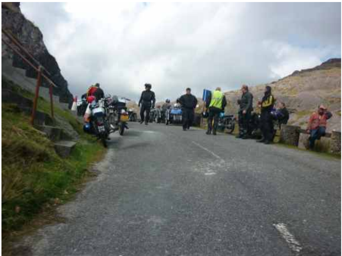
At the summit of Healy Pass.