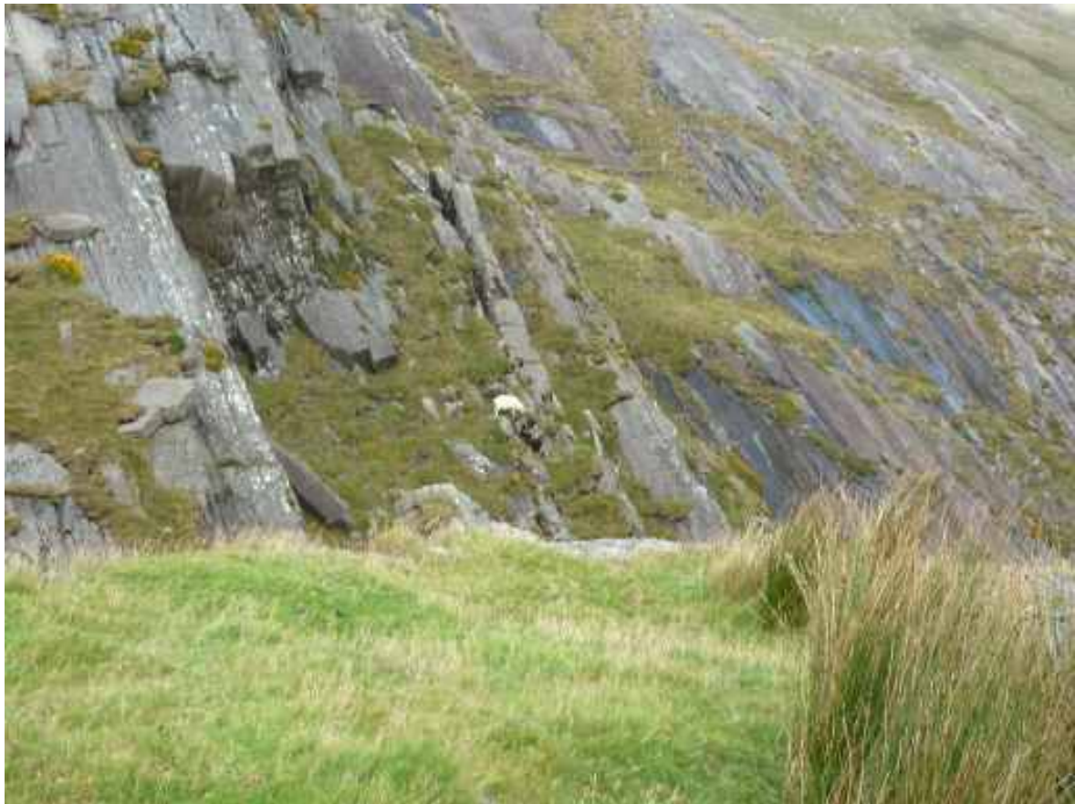
Another local resident happily going about business as usual, all be it on the side of a rather steep cliff face.